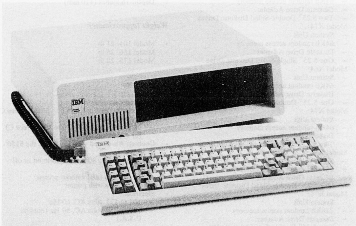
Figure 11-1. 5150 System Unit Model 176

The 5150 System Unit Model 176 for the IBM Personal Computer is shown in Figure 11-1.