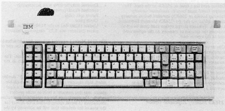
Figure 11-2. U.S. English 83-key keyboard for the IBM Personal Computer

This option increases the speed and precision of arithmetic, logarithmic, and trigonometric functions. It provides an Intel 8087 coprocessor that performs floating-point arithmetic and provides three to ten times better performance than the 8088 microprocessor executing floating-point subroutines, depending on the operation performed. Multiply and divide operations provide the lower performance improvements while logarithmic, trigonometric, and square root operations provide the higher performance improvements. See Section 13:10 under "Math Co-processor Option" for a description of this feature.