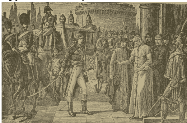
Taking the Pope Prisoner. 1798.