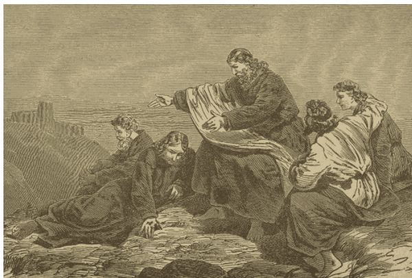
Jesus on the Mount of Olives

Probably no other chapter of the Bible speaks more fully, and more definitely, upon the subject of the second advent, than Matthew 24, in Christ's own words. We invite the attention of the candid reader to a brief explanation of the entire chapter.