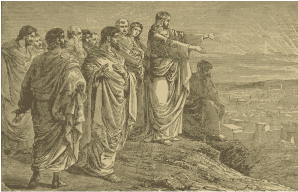
Christ Weeping Over Jerusalem

But what are the facts in the case? Can anything be learned from the Bible relative to the time of the second advent? This is a grave inquiry; and, from the very nature of the subject, is worthy of close investigation, and a candid answer. It is a matter of painful regret that many, under the influence of popular prejudice, have decided that the period of the second advent is a secret, hidden with the Lord. While these can scarcely be reached with this subject, as long as they remain under the influence of those who denounce all investigation of it as prying into the secrets of the Almighty, there is still, we believe, a larger class [009] who wait for evidence before deciding.