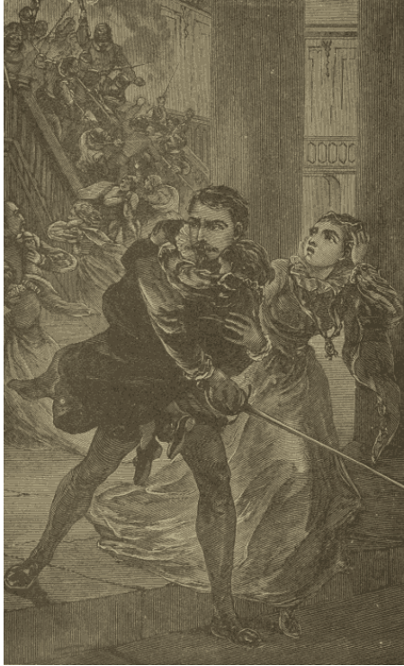
St. Bartholomew Massacre.