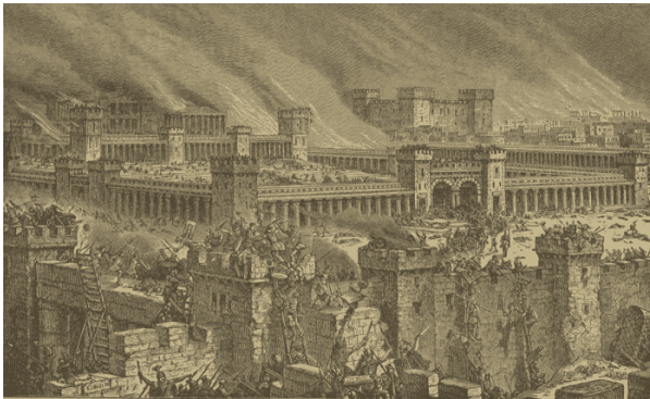
Destruction of Jerusalem by Titus