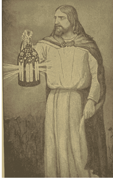
The Light of the World