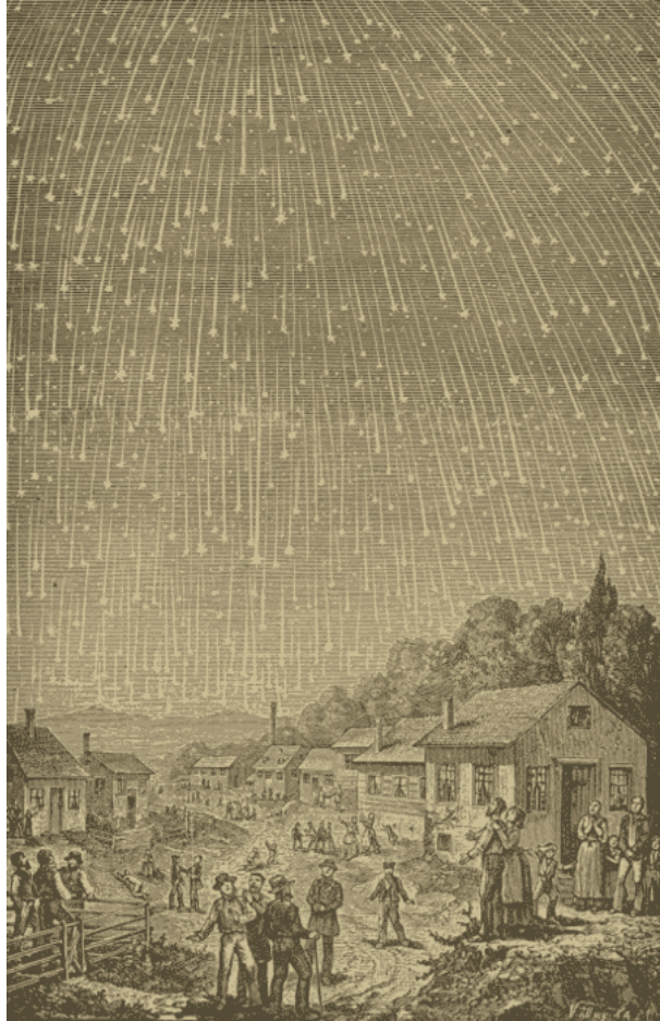
The Falling Stars.

A celebrated astronomer and meteorologist, says:—