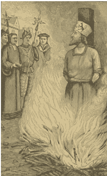
Martyrdom of Huss

VERSES 9, 10: “Then shall they deliver you up to be afflicted, and shall kill you; and ye shall be hated of all nations for my name's sake. And then shall many be offended, and shall betray one another, and shall hate one another.”