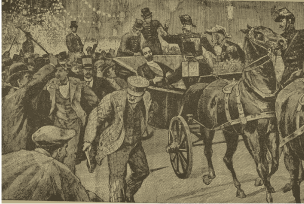
Assassination of Carnot.

The times we live in are anomalous to any that have ever preceded us. For some years there have been universal and active preparations for war, and almost universal peace. To secure the greatest efficiency of armed forces for defensive and offensive purposes, has been the prime consideration of government, especially so, as far as the Old World nations are concerned. Europe echoes to the tread of vast hosts of war while the nations are driven to their wits' end to provide for their support. It is well known that these costly preparations are not for show; and the hearts of men quail in view of the culmination which, though delayed, must soon be reached.